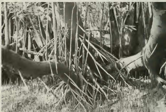
Fig. 2. Avicennia officinalis , showing pneumatophores and prop-roots. Sg. Santouboug, January 21, 1976

Tan & Keng (1969) report that in the vasculature of the [usually] 4-lobed corolla of 3 of the 4 species investigated three species have 4 traces each supplying one corolla-lobe, but in A. officinalis an additional trace runs into the posterior corolla-lobe. This suggests that the present 4-lobed corolla of the genus is probably derived from a 5-lobed ancient form and this is further borne out by the fact that 5-lobed corollas are occasionally found in A. officinalis . These authors also point out that even